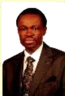
Prof. PLO Lumumba

Member, Representing Attorney General of the Republic of Kenya