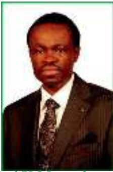
Prof. PLO Lumumba Director/Chief Executive & Secretary, Kenya School of Law Board

Education and training are great engines for socio-economic change and transformation. Properly harnessed, the training of competent professionals can become the principal vehicle through which the Government can deliver quality services. In Kenya, the Council of Legal Education (Council)/Kenya School of Law (School) have until recently been charged with the responsibility of supervising and controlling all aspects of legal education and training on behalf of the Government of Kenya. These mandates have until recently been discharged only partially.